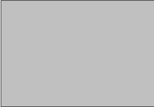
FIGURE 2. View at laparotomy: ACB from the third and fourth parts of duodenum (arrowed) to the root of mesentery. Forceps points to the ligament of Treitz.

in the present case contained tiny vessels and not a fibrous band; it arose from the antimesenteric wall of the duodenum and was inserted into the root of mesentery; and there was no intestinal malrotation, which is associated with type 4 band. We conclude that the duodenal obstruction in our case was from ACB. Akgur et al. reported eight children with ACB which did not cause duodenal obstruction. Each band contained tiny blood vessels, as was so in our case. 4 On histological examination, the ACB contained blood vessels and nerve plexi. Based on the origin and insertion of ACB, we agree with Akgur et al. that it may have been a mesenteric anomaly. 4